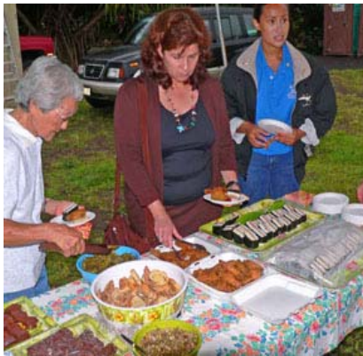
Pupus served prior to the tour