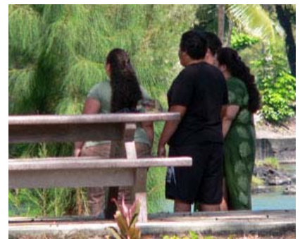
Oli by Students of Ke Ana La'ahana Charter School