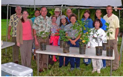
Some of those who braved the weather to attend