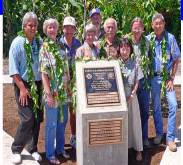
The Unveiling of Plaque